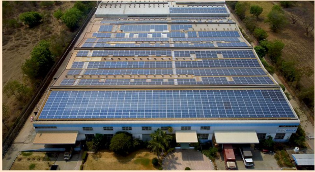
OMR Bagla 950.4kWp