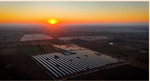
Dhamangaon, Amravati 28MWp(DC)/ 20MW(AC)