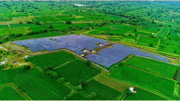
CEL - Dhalegaon 1.4 MWp