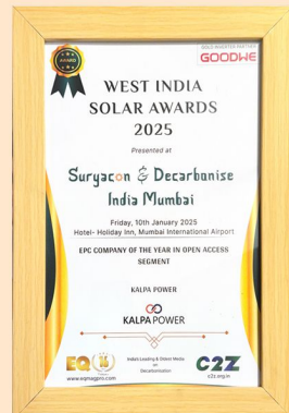
EPC Company of the year in Open Access Category