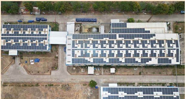
The Supreme Industries 930 kWp_ Gujarat