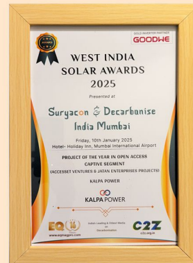
Project of the year in Open Access Captive Segment