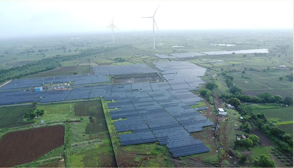
Omurga, Dharashiv 28MWp(DC) / 20MW(AC)