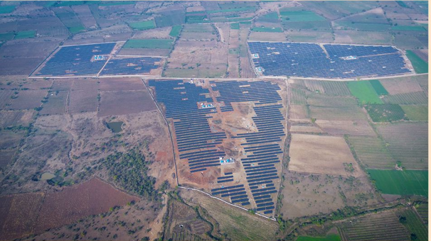
Dhamangaon, Amravati 28MWp(DC)/ 20MW(AC)