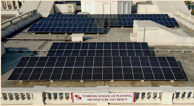
Symbiosis Nagpur 620 kWp