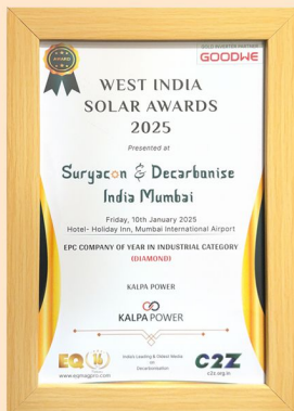
EPC Company of the year in Industrial Category