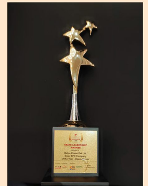
Solar EPC Company of the Year - Open Access

We are amongst The Top 5 Solar Installers in India!