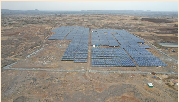
CEL Bhadli 3 MWp