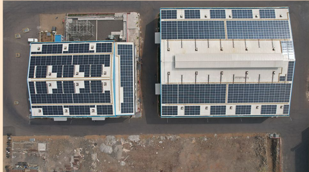
Sound Castings 500kWp